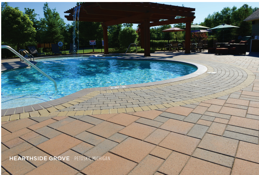
HEARTHSIDE GROVE PETOSKY, MICHIGAN

SOLUTION: Durability and design needs were met with a mix of Unilock EnduraColor™ and EnduraColor™ Plus Architectural Finishes pavers. The unique brushed texture of Il Campo® lent an organic feel to the space and provided a slip resistant surface, while Umbriano® offered the benefit of an integral EasyClean™ surface protection that makes for easier cleanup around heavy use features like park benches.