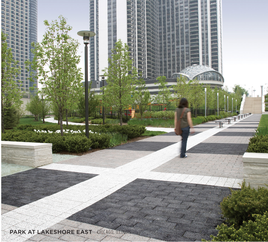
PARK AT LAKESHORE EAST CHICAGO, ILLINOIS