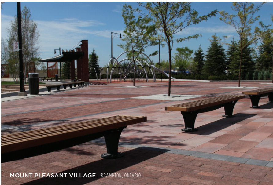
MOUNT PLEASANT VILLAGE BRAMPTON, ONTARIO

SOLUTION: Unit paving was a sensible choice as the pavers can be lifted and set back in place when underground maintenance is required. Unilock Series 3000® was selected for its exposed aggregate finish which only gets better with time. As it wears, natural granite and quartz particles become more exposed, further enhancing the beauty of this Unilock EnduraColor™ Plus Architectural Finishes product.