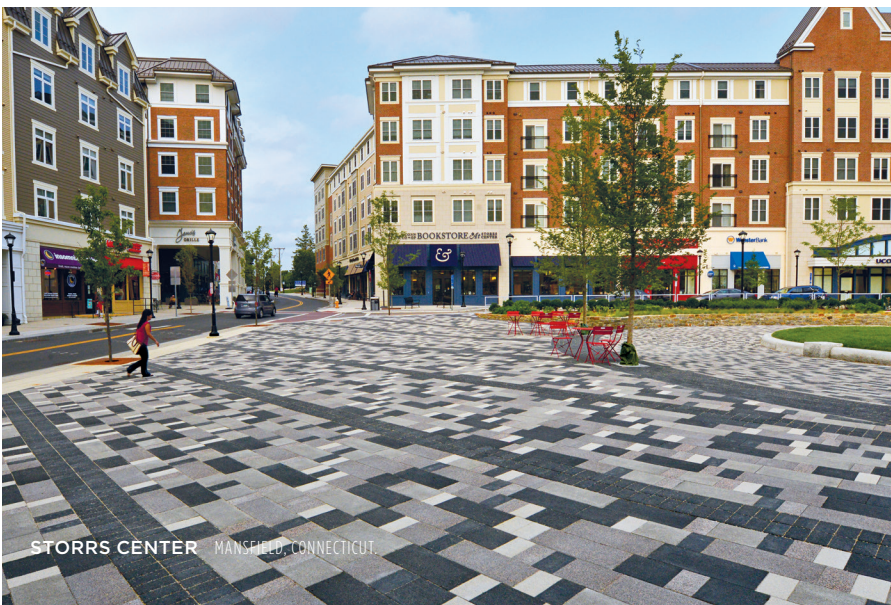
STORRS CENTER MANSFIELD, CONNECTICUT.

SOLUTION: In many major cities like New York, permeable paving is installed around the tree pit to ensure enough water is sent to the root system thereby reducing the replanting rate. Water freely drains through the pavement, carrying much needed oxygenated water to the root zone while reducing puddles and stormwater runoff.