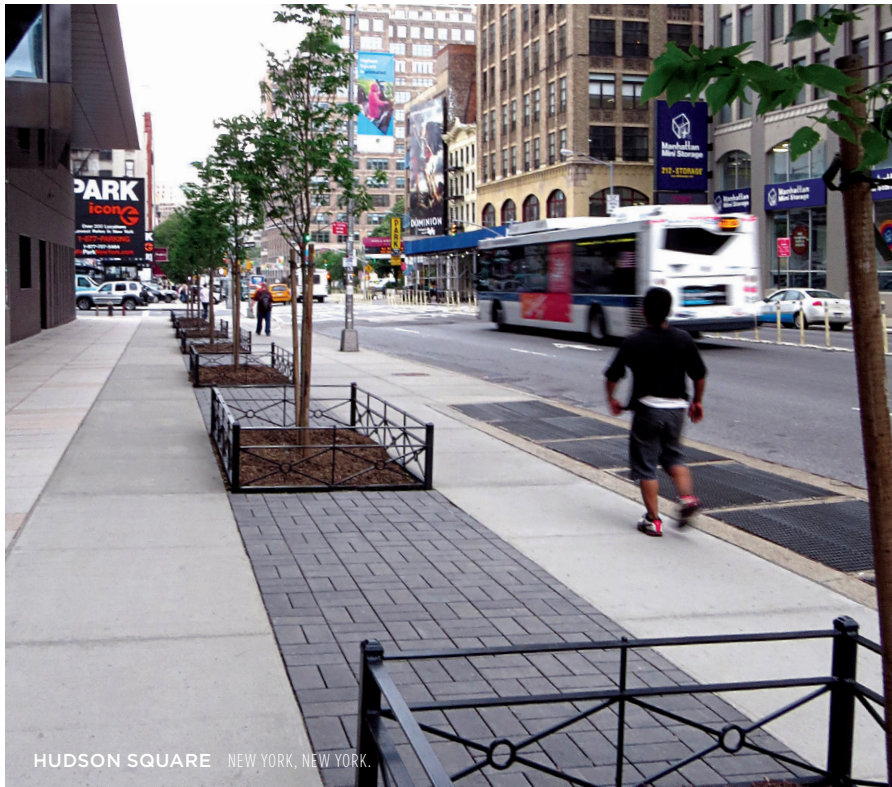
HUDSON SQUARE NEW YORK, NEW YORK.

Municipal projects must meet the demands of many stakeholders and so they are faced with unique landscaping challenges. The following are just a few examples of how Unilock projects can help provide solutions.