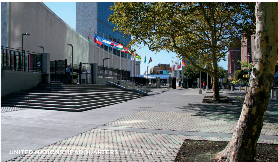
UNITED NATIONS HEADQUARTERS NEW YORK, NEW YORK.

SOLUTION: Unilock Umbriano® pavers delivered the look of granite in keeping with the upscale neighborhood while remaining sensitive to the budget at hand. The linear shape of the paver reflected a high standard of design while being capable of withstanding the loads of the trafficked roadway. In the event of further construction or repairs to infrastructure below the finished streetscape, pavers can be lifted and replaced with minimal disruption to local traffic.