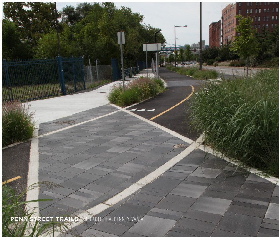
PENN STREET TRAILS PHILADELPHIA, PENNSYLVANIA.

SOLUTION: The use of permeable pavers allows the municipality to manage the amount of stormwater that enters the system and limits localized flooding. By making one-quarter of the sidewalks permeable with Unilock Eco-Priora™ pavers, nearly all the rain during a 2" storm is diverted from the city's overburdened sewer system. Not only does this help address flooding but also sewer overflow.