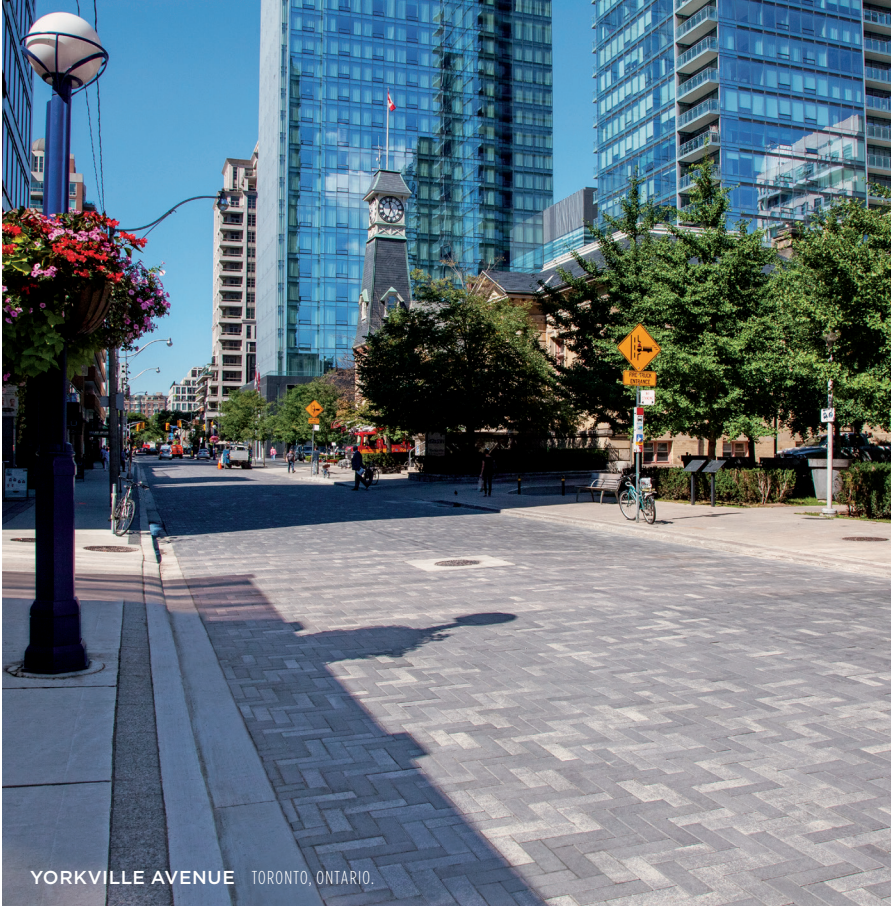
YORKVILLE AVENUE TORONTO, ONTARIO.